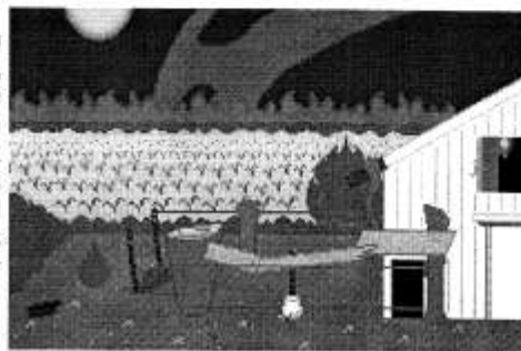
(rough sketch of the old Ragan backyard)